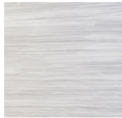
Brushed Nickel SR222NK