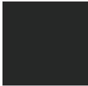
Matte Black SR222B