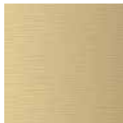
Brushed Brass SR230BB