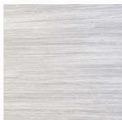
Brushed Nickel SR230NK